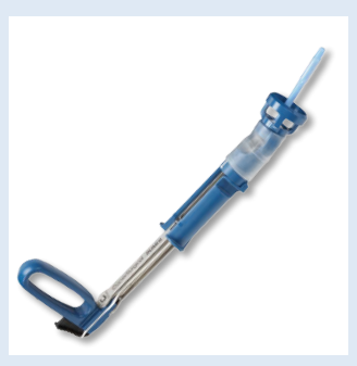
RUMI II with Uterine Tip and Koh-Efficient