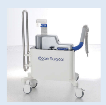
ALLY UPS Cart (shown with ALLY UPS)