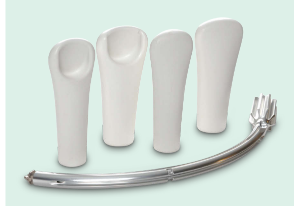
Hoyte Sacro Tips for Vaginal Prolapse Repair Are Ideally Suited for Use With the ALLY UPS

ALLY UPS ensures steady cephalad pressure, helping to increase the distance between the ureters and other critical anatomy during dissection. Establishing these landmarks and distancing vital anatomy can prevent complications while performing the colpotomy incision.