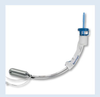
Advincula Arch with Uterine Tip and Koh-Efficient