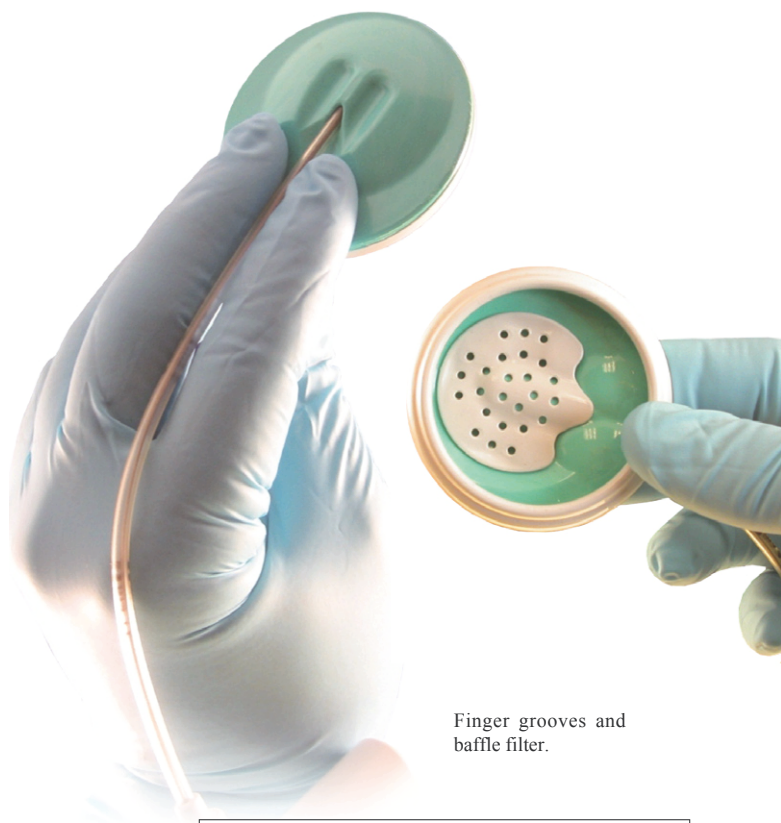
Finger grooves and baffle filter.

Kiwi is the trademark of Clinical Innovations, Inc